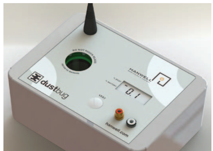
DustBug radio transmitter with external power supply option and composite video connector